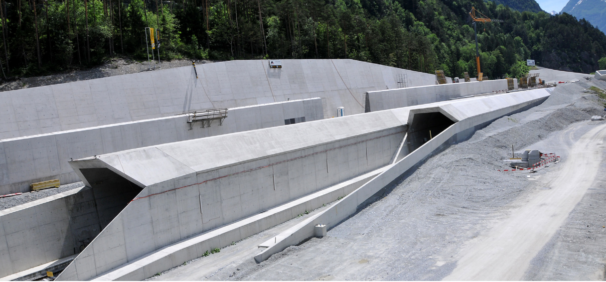
Gotthard Base Tunnel northern side portals near Erstfeld

centerpiece of the Amsteg section, which is roughly 11 kilometers long. Before the tunneling towards Sedrun could begin, a 1.8-kilometer-long access adit had to be built. Then came the excavation of a "base point" with rail technology caverns, construction adits and intersections. A tunnel boring machine with a diameter of 3.7 meters drilled a 1.8-kilometer-long cable adit to connect to the underground center of the Amsteg power station for subsequent traction supply. During blasting, the first 400 meters of each tunnel tube and the assembly caverns for setting up the tunnel boring machines were excavated. Both tunnel boring machines started driving at full capacity towards Sedrun at three-month intervals. After crossing a predicted fault zone without any problems in the western tube, tunneling came to a surprising standstill when a water ingress washed loose material into the drill head and caused a blockage. To free the tunnel boring machine, it was driven backwards out of the eastern tube, and the entire loosened zone was strengthened with massive injections. Tunneling could resume again after a standstill of around six months. Thanks to an average daily output of 11.05 meters, the holing-through of both tubes to the Sedrun section was celebrated several months ahead of schedule, despite the standstill.