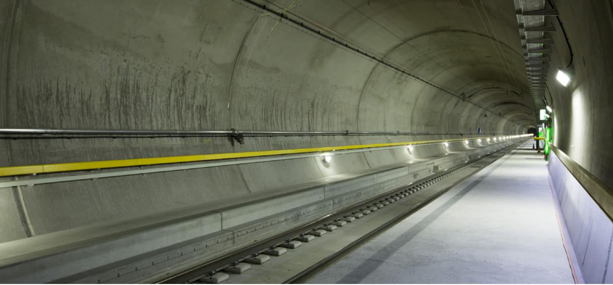
System with two single-track tunnels, each 57 km in length